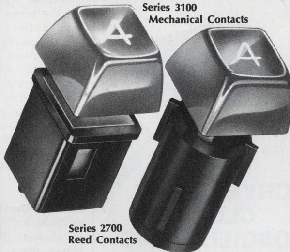
Series 2700 Reed Contacts

Announcing two new switches from Maxi-Switch. Use them individually to build calculator blocks or alpha-numeric keyboards, or order completed units from Maxi, with or without encoding. Both switches accept standard Maxi double-shot molded buttons.