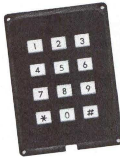
12 KEY MATRIX