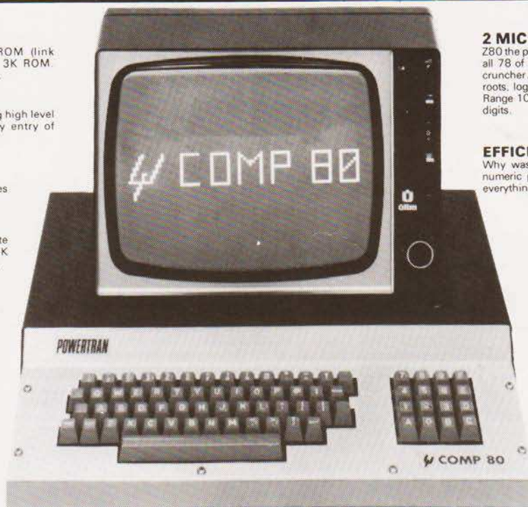
Cabinet size 19.0" x 15.7" x 3.3" Television by courtesy of Rumblelows Ltd., price £58.62