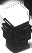
T-5J 3/4" SEALED AND LIGHTED