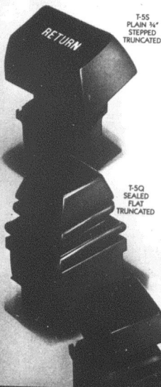
T-5S PLAIN 3/4" STEPPED TRUNCATED